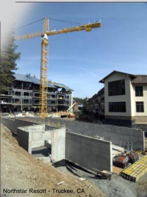
Northstar Resort - Truckee, CA

The crane is a fantastic piece of equipment. It saves us an enormous amount of work. But like anything else that's big and powerful, it can be dangerous. So please be careful and use extra caution on jobsites where cranes are present.