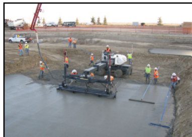
First Pour at Thunder valley

Urata's $30 million dollar contract includes pouring and finishing 1.8 million square feet of parking garage slabs, hotel tower foundations and over 600,000 square feet of elevated slabs. We will also be pouring over 500,000 square feet of slab-on-grade and slab-on-metal deck not to mention over 100,000 square feet of new exterior flatwork at support structure foundations. When this project is completed it is expected to generate